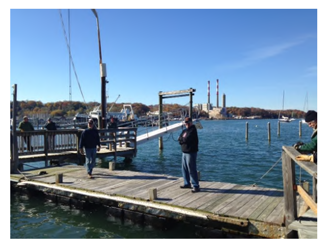
Docks and Floats

This season we will be installing 2 new electric stanchions and moving one of our existing stanchions to the east dock. The stanchion at the north end of the west dock has corrosion issues and will be replaced with a new unit of the same brand. Both stanchions at the end of the west dock will have four 30 amp twists and one 50 amp twist as well as a water spigot. We will salvage the useable cover plates, circuit breakers, photo sensors, etc. The next to last stanchion on the west dock will be relocated to the east dock giving us four 30 amp twists to serve two boats on that dock. To accommodate the new electric service without rewiring all the docks, we will only be rewiring the southern two stanchions on the west dock to have only 15 amp GFCI plugs and circuits. Boats that require 30 amp shore power are never docked in the bays closest to shore.